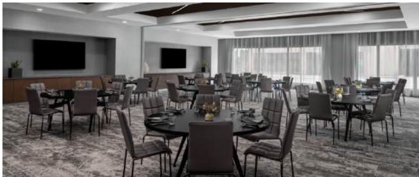
AC Lounge – Wrap Up Cocktail Hour