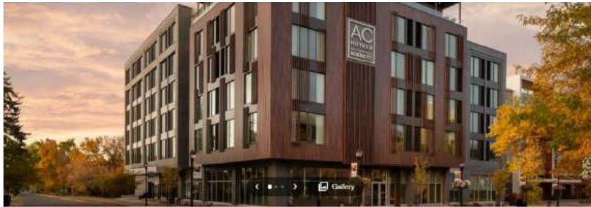
AC Benchmark – Rooftop Bar – Welcome Cocktail Mixer